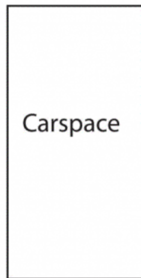
(not in position)