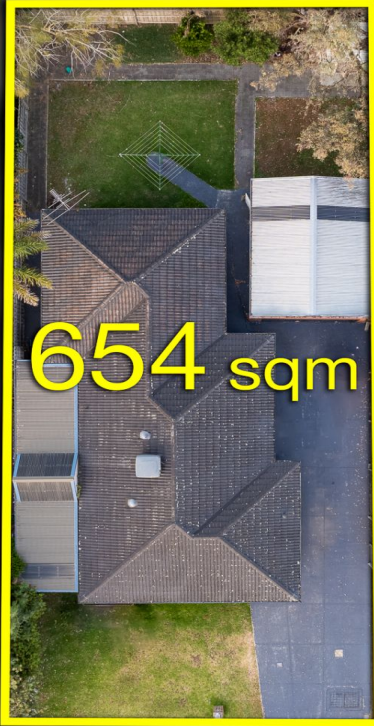
52 Summerlea Rd, Narre Warren, VIC 3805