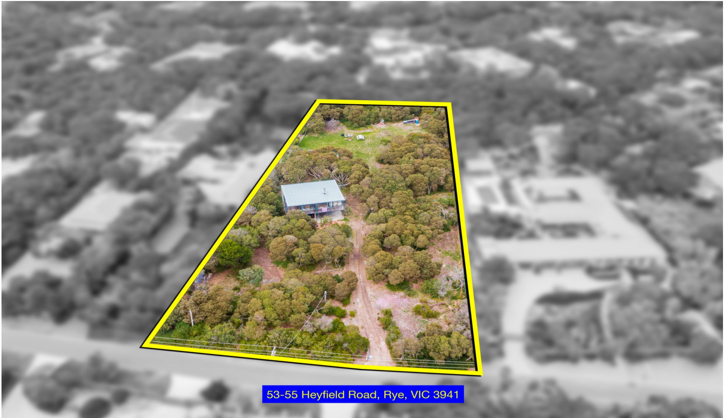
53-55 Heyfield Road, Rye, VIC 3941