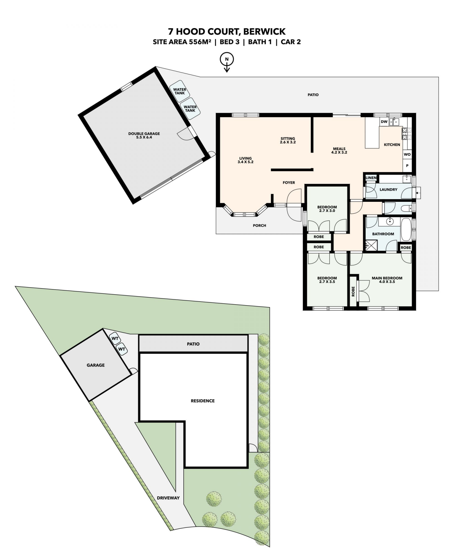
BIGGIN & SCOTT* REAL STATE DOES NOT GUARANTEE THE ACCURACY OF ANY INFORMATION IN THIS BROCHURE. CREATED BY DIGITALMEDIUM.NET.AU