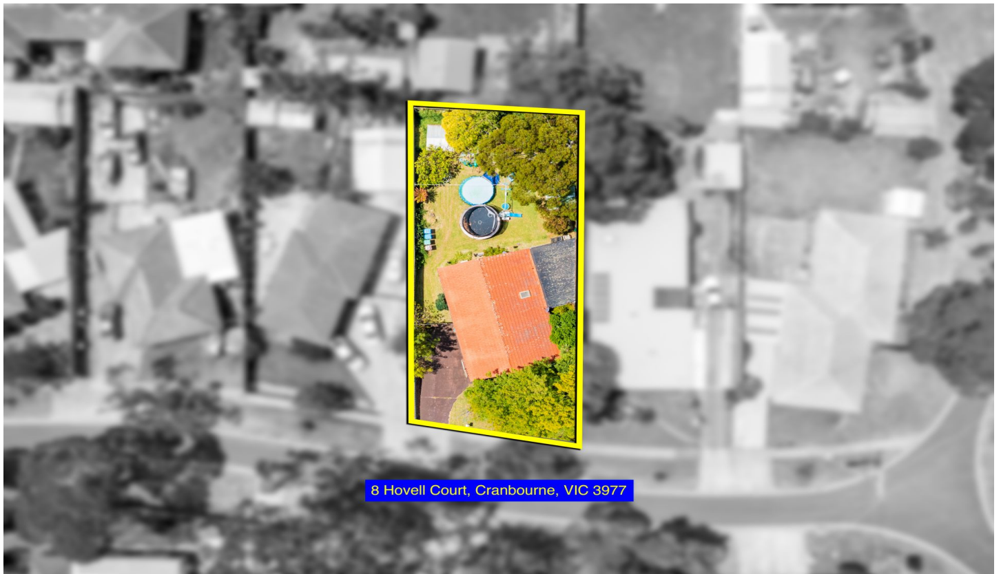
8 Hovell Court, Cranbourne, VIC 3977