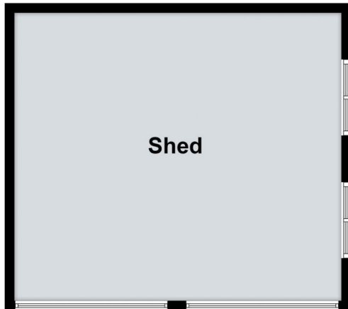
Not in Position