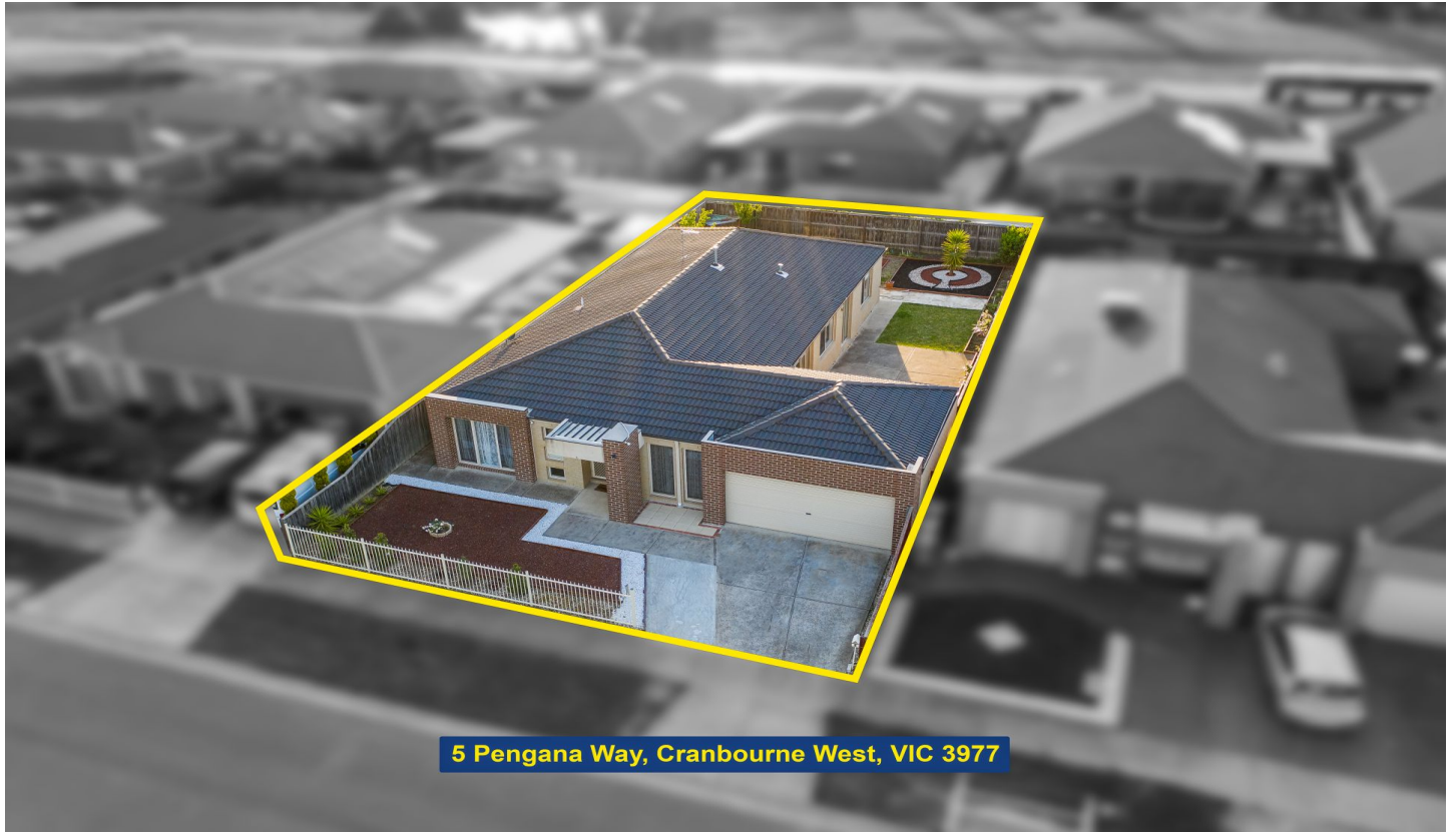
5 Pengana Way, Cranbourne West, VIC 3977