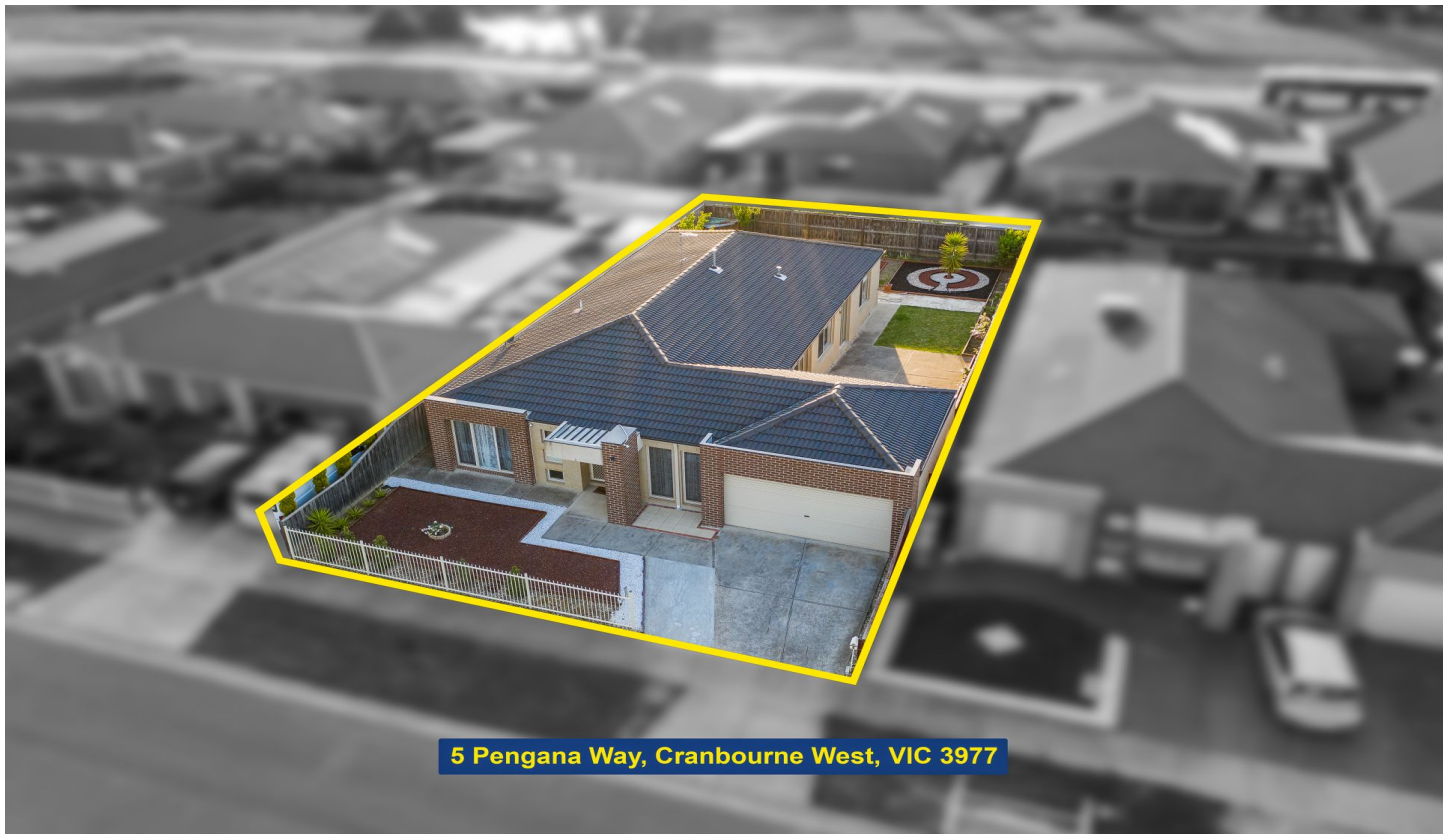
5 Pengana Way, Cranbourne West, VIC 3977