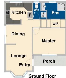
Ground Floor Granny Flat