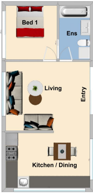
Granny Flat Floor Plan