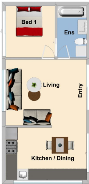
Granny Flat Floor Plan